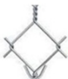
Knuckle / Barb Selvedge