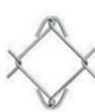
Knuckle / Knuckle Selvedge