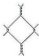
Barb / Barb Selvedge