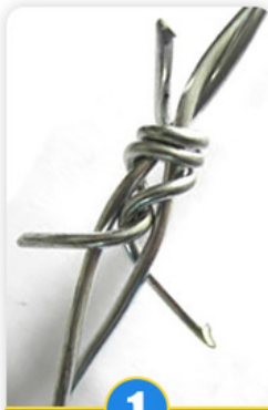
Traditional twisted barbed wire