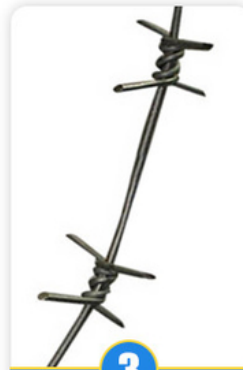
Single stranded barbed wire