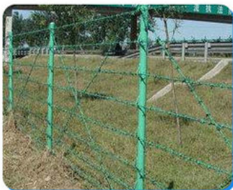
2. Hang the barbed wire on the hook, use a spanner to tension the span.