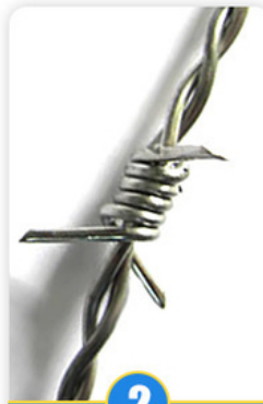
Double twisted barbed wire