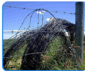
1. Attach the barbed wire on the concrete/wooden post with binding wire or nails.