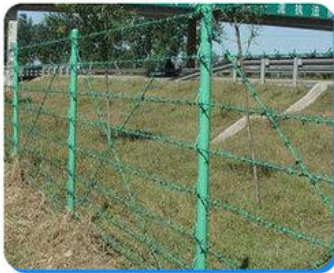
2. Hang the barbed wire on the hook, use a spanner to tension the span.