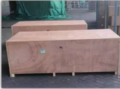
4.WOODEN CAGE PACKAGE